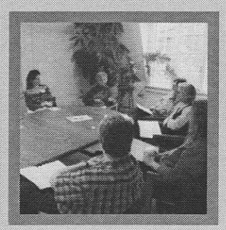
RIG<sup>2</sup> members talk about math and science education for women and minorities at the RIG-A-Fair.