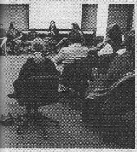
enerational grief and healing at the RIG-A-Fair.

The research project, Welfare Reform, Self-Sufficiency and Family Well-Being in Oregon, has three interwoven components. An institutional ethnography of Adult and Family Services, the state agency that administers welfare programs, will describe policy implementation and the work lives of agency staff. Research teams will observe client and staff interactions in three branch offices, interview agency staff and administrators, and review program documents. A combination of client surveys and in-depth case studies will monitor changes in family well-being and self-sufficiency as clients participate in welfare programs and transition between welfare and work over a two-year period.