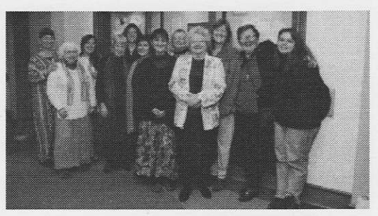
Calyx staff and supporters celebrate the opening of the exhibit.

Long said that the library is continually increasing its collections of papers by women. The Duniway papers—which include Duniway's journal from her family's trek to Oregon when she was seventeen years old, numerous political and poetic writings, and the original proclamation when the suffrage amendment passed in 1912—were a gift from the family of David Duniway in 1993. The Calyx records were received partly as a gift and partly by purchase in 1997.